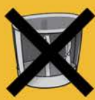
TINTED PLASTIC BAGS