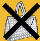
LARGE PRINTED BAGS